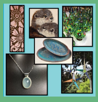
Zanesville Muskingum County Conference & Welcome Center 205 N. First St. Zanesville, OH

BUY LOCAL FOR THE HOLIDAYS Holiday shopping made easy this year with a variety of unique handmade gifts. Tasty Food & Lively Music